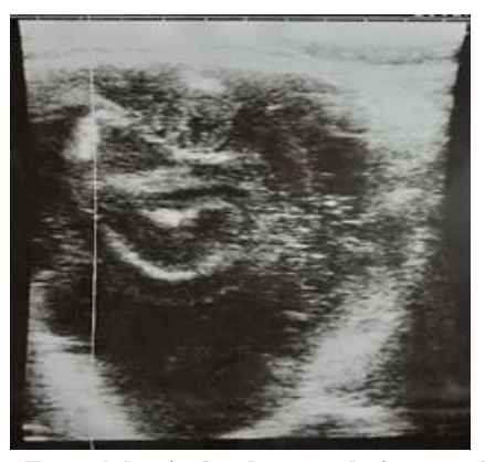
Figure 1: Transabdominal ultrasound image showing a multiloculated cystic mass with heterogeneous echogenic content in the lower abdomen.

Histopathological examination revealed an inflamed mesenteric lymphangioma, confirming the benign nature of the lesion.